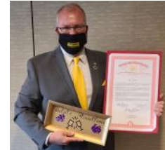
Sept. 29- 2020 Recovery Month Recognition (Albion)