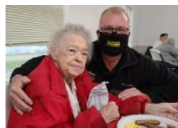
Oct. 25- American Legion Breakfast (Albion)