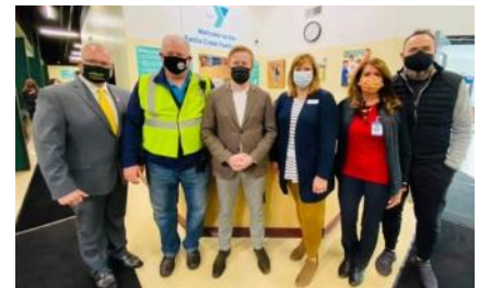
April 23– Meet w/ Congressman Meijer (Battle Creek)