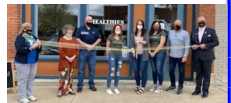
April 30 – Ribbon Cutting (Homer)