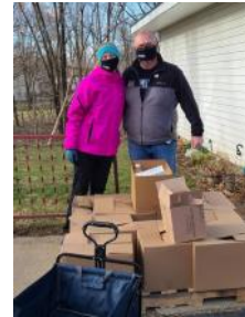
April 1 – Community Action Food Distribution (Homer)