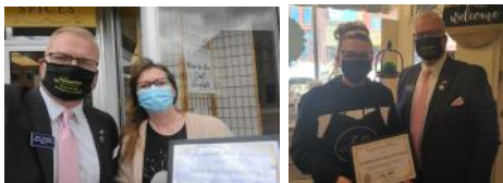
April 30 – Welcome New Businesses (Albion)